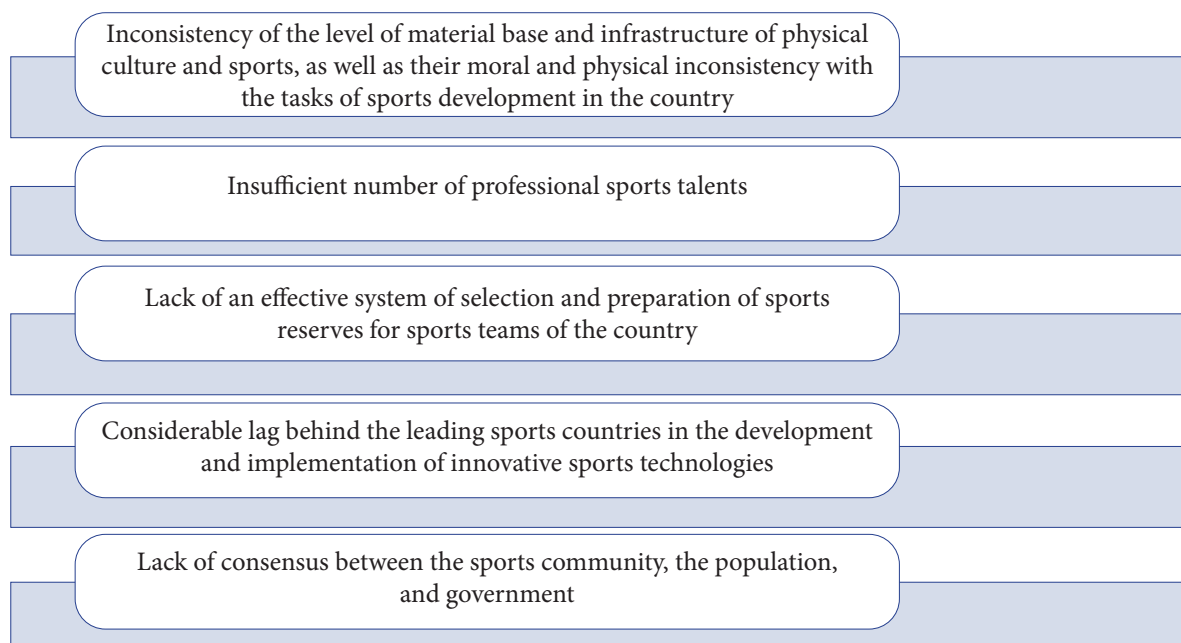
Figure 2. Modern problems of physical culture and sports policy

Some problems of the physical culture and sports sphere reflected in the official programme documents are not fully formulated. The reason for this is a partial replacement of concepts. Very often, problems are called only certain factors that contribute to their occurrence and development, and in some cases, its negative result is considered as a problem. Trying to cover the whole complex of negative phenomena of the physical culture and sports sphere in this way, the state faces the impossibility of solving them in determining the time frame. This creates dependent sentiments both in society and in sports, allowing blaming the state authorities for the poor organisation of the declared political course every time. Because of this circumstance, it is necessary to reconsider approaches to the formulation of issues that should be resolved at the state level. First of all, it is necessary to clarify a number of controversial provisions in the official programme documents of the state physical culture and sports policy (Fig. 2).